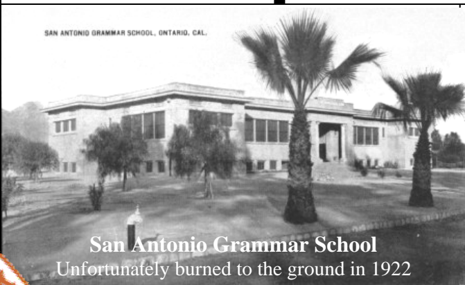
SAN ANTONIO GRAMMAR SCHOOL, ONTARIO, CAL.