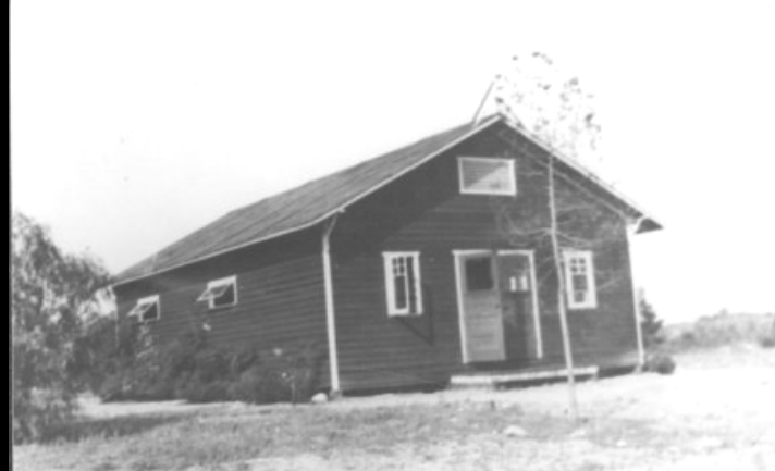
BLACKBURN SCHOOL -Located on the east side of Euclid between C & D Streets, Ontario